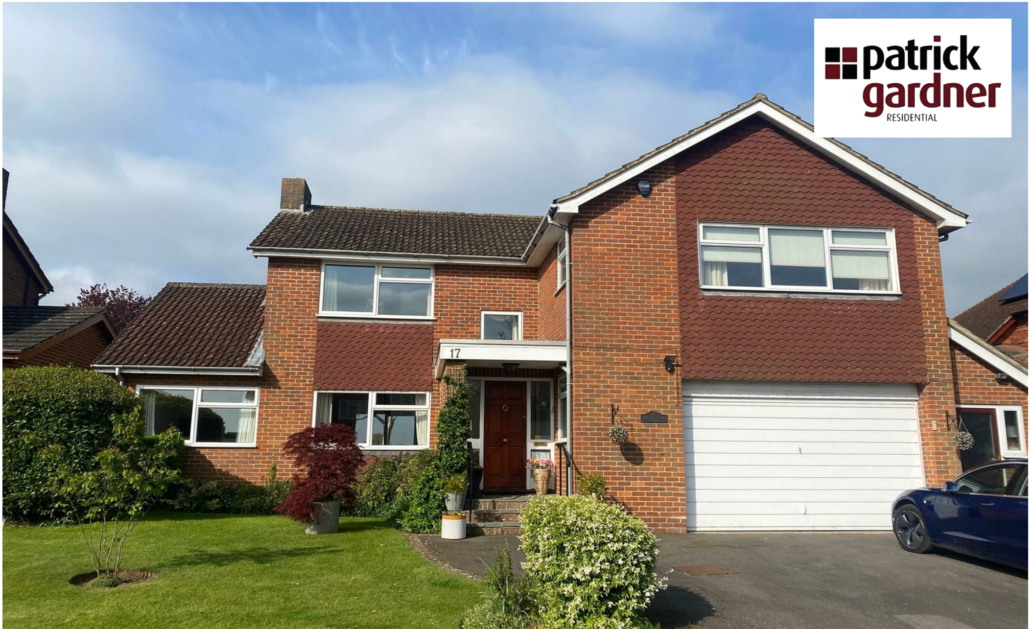
17 Kidborough Down, Great Bookham, Surrey, KT23 4LG