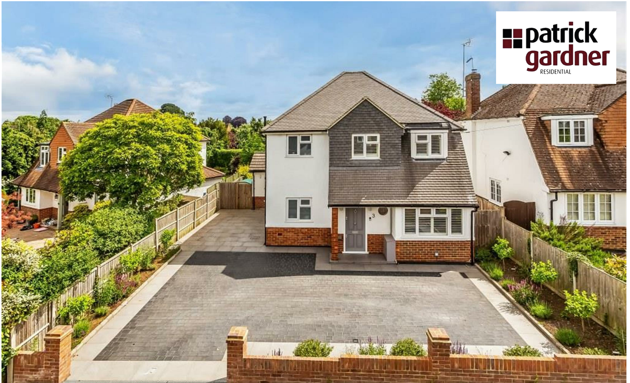
3 The Lorne, Great Bookham, Surrey, KT23 4JY