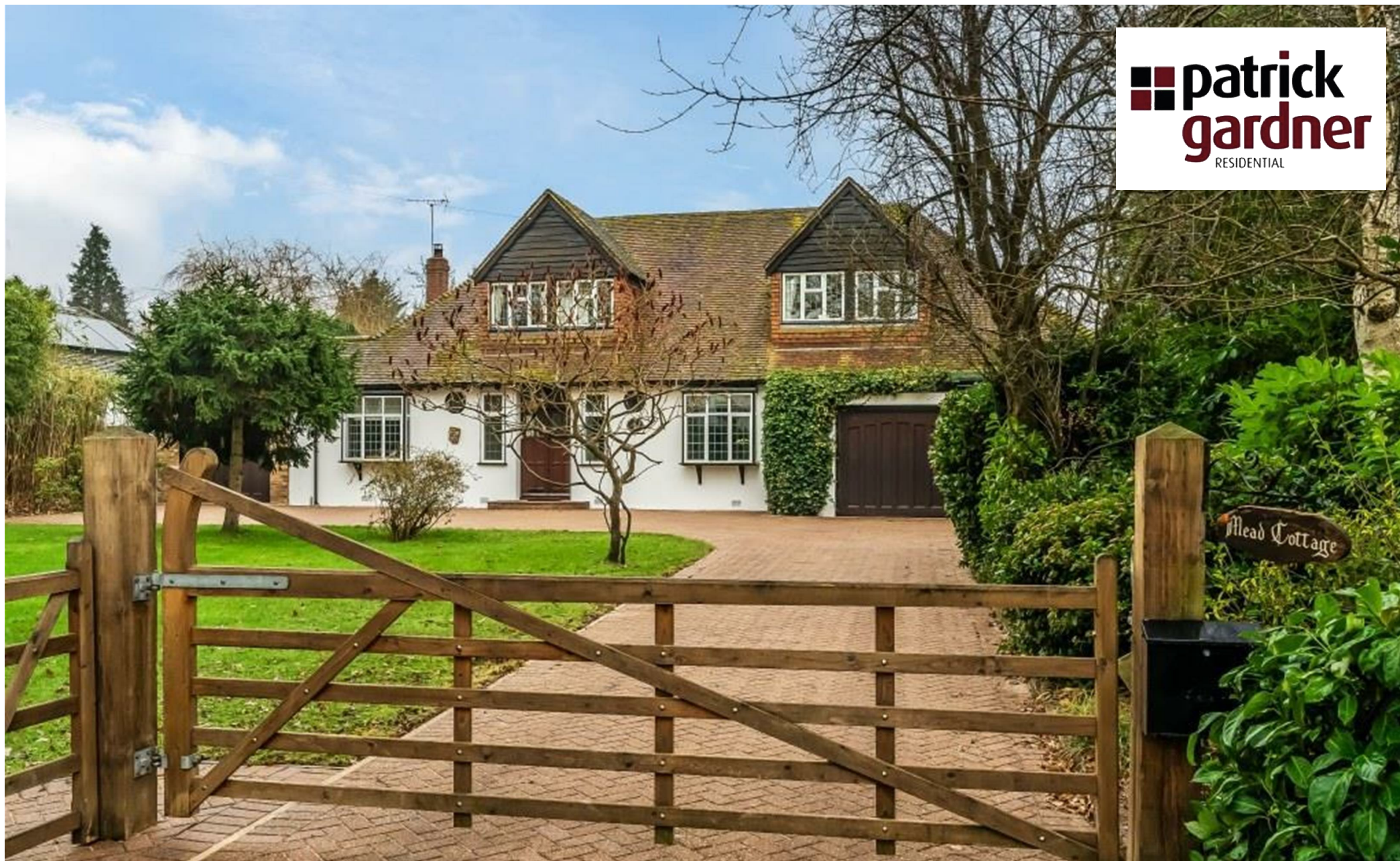
Mead Cottage Meadowside, Great Bookham, Surrey, KT23 3LF