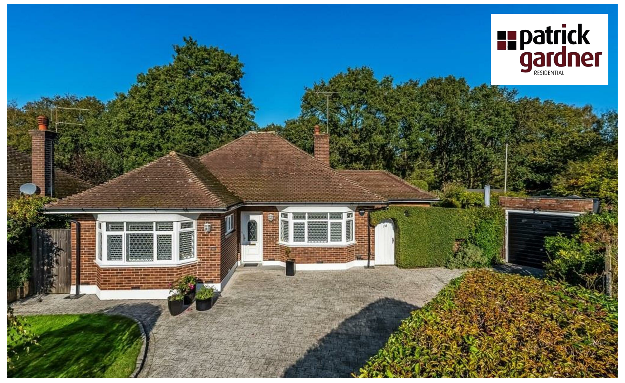
14 Westfield Drive, Great Bookham, Surrey, KT23 3NU