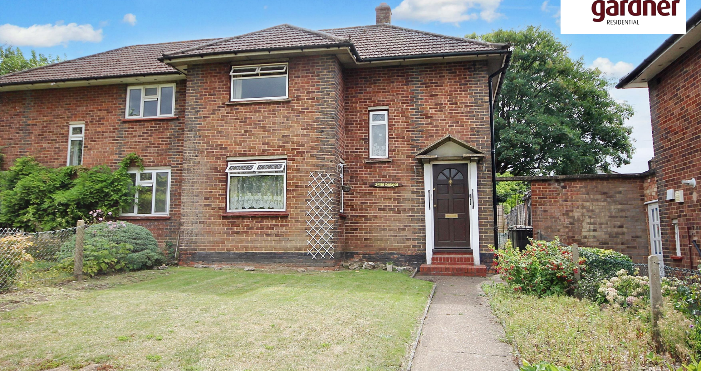
2 Flint Cottages Leatherhead Road, Great Bookham, KT23 4SX