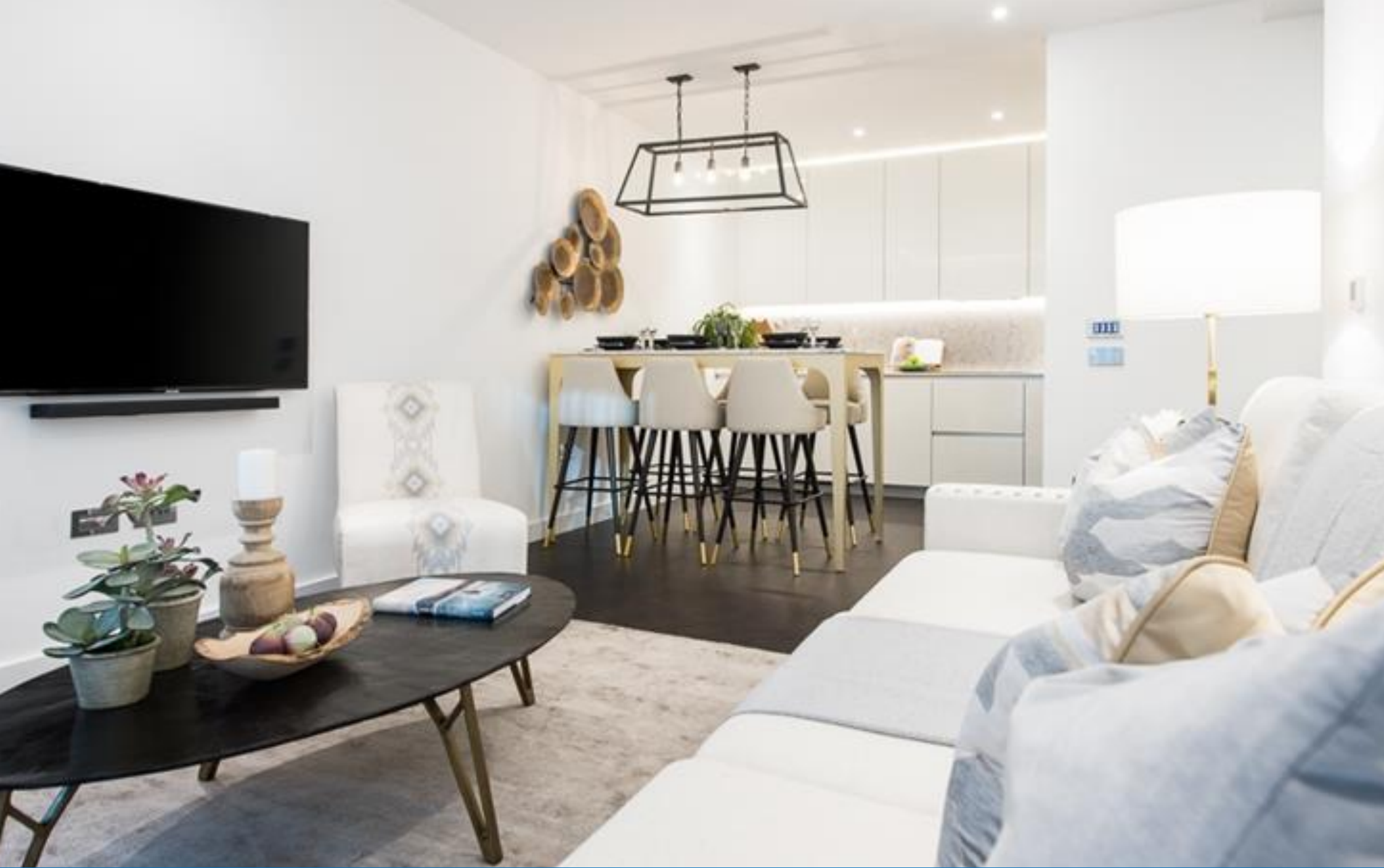
Thornes House, Vauxhall, SW11