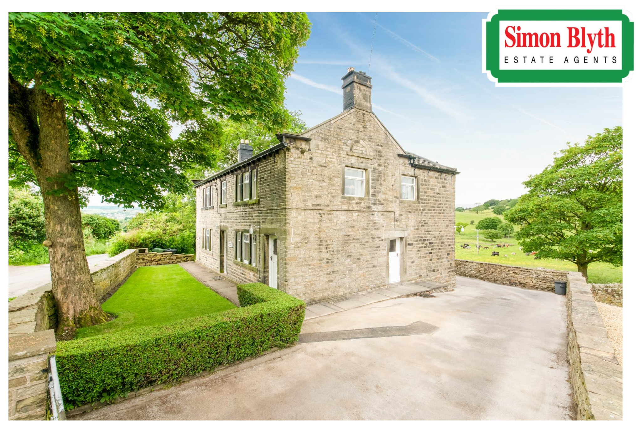
CROFT BOTTOM FARMHOUSE & COTTAGE, FULSTONE, HD9 7DL