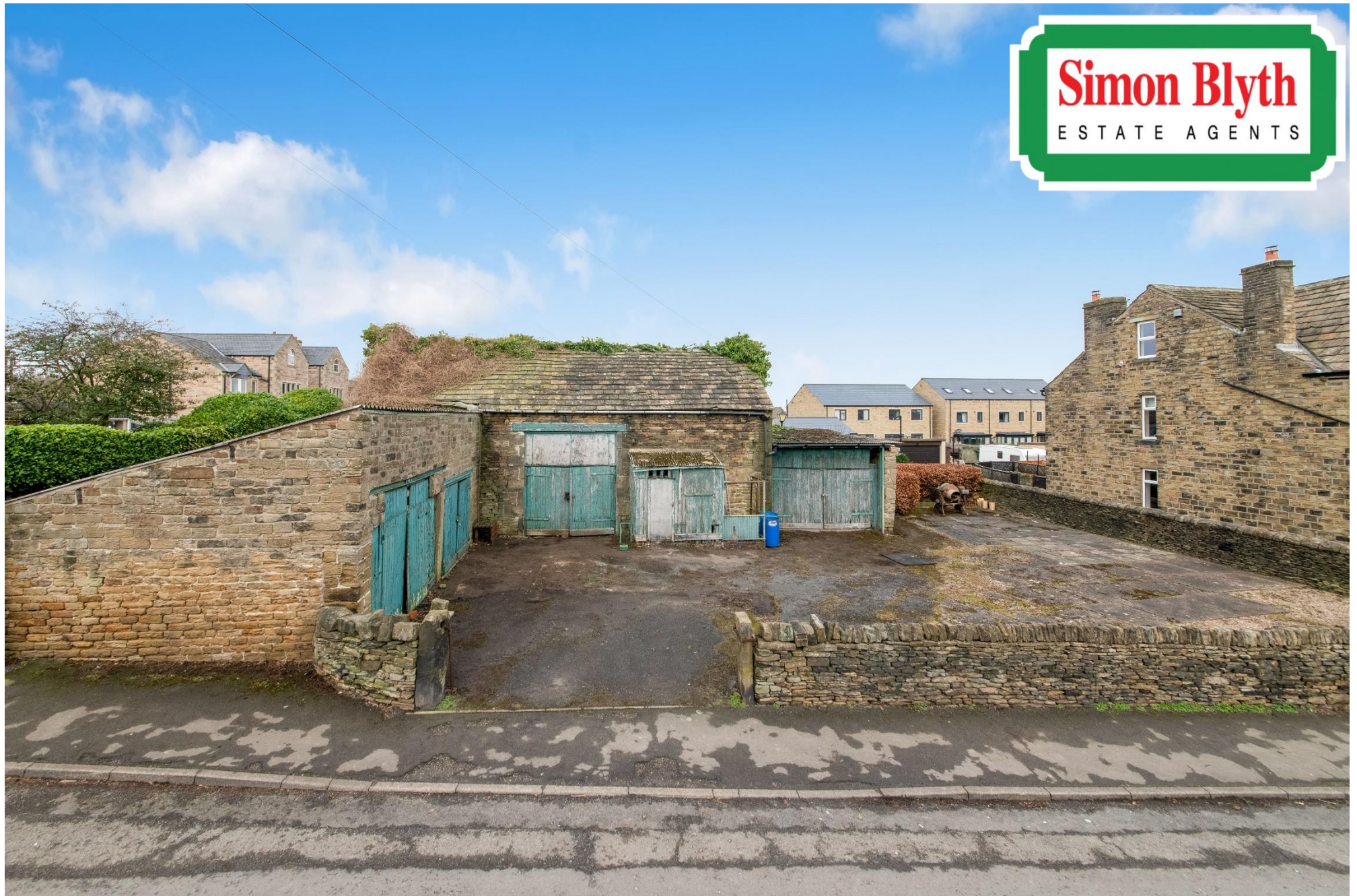
THE OLD BARN, STATION ROAD, SHEPLEY, HUDDERSFIELD HD8 8DR