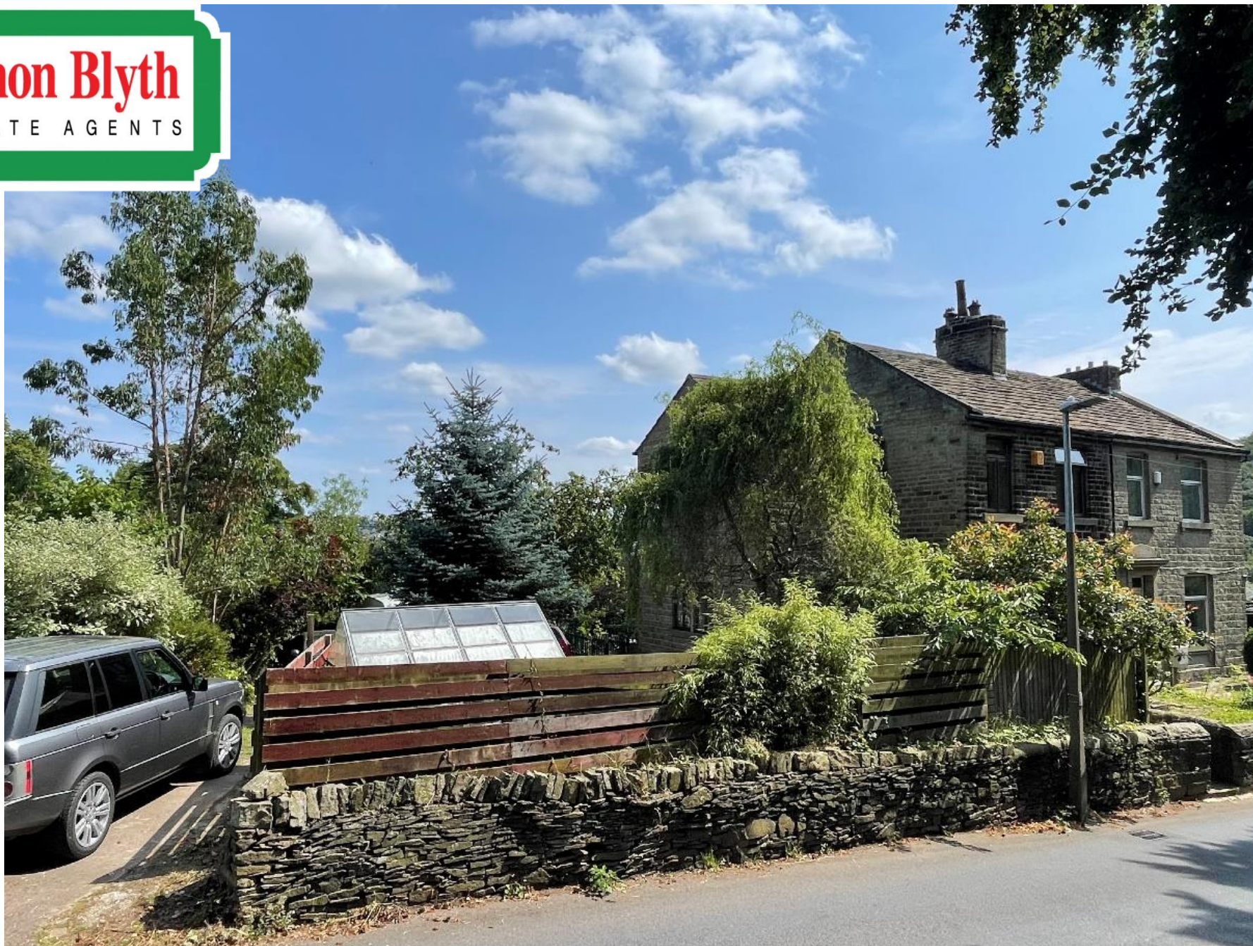
AMAZON COTTAGE, 44 ST HELENS GATE, HUDDERSFIELD, HD4 6SG