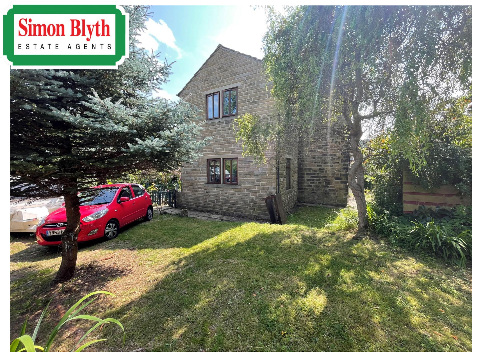
ST HELENS GATE, HUDDERSFIELD, HD4 6SG