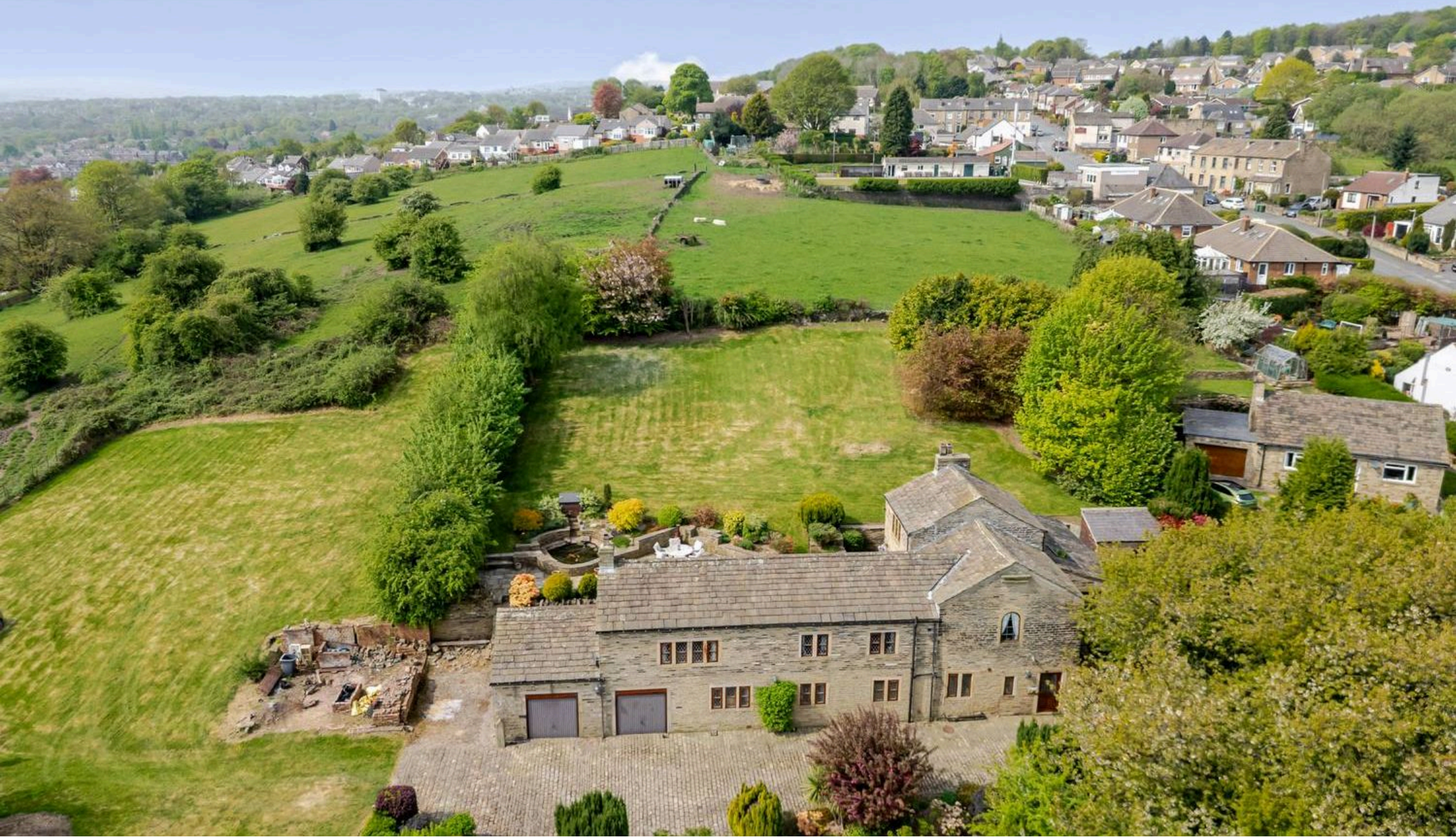
Cowcliffe Farm Netheroyd Hill Road