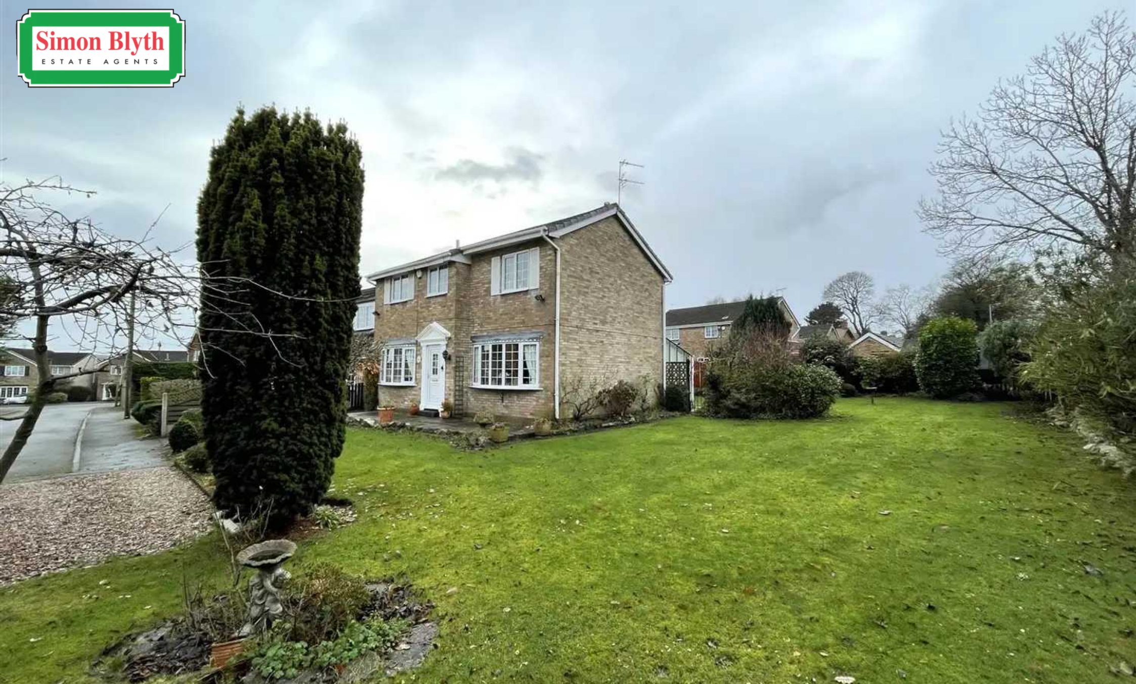
Rosebank House, 5, Quarry Close, Darton Barnsley