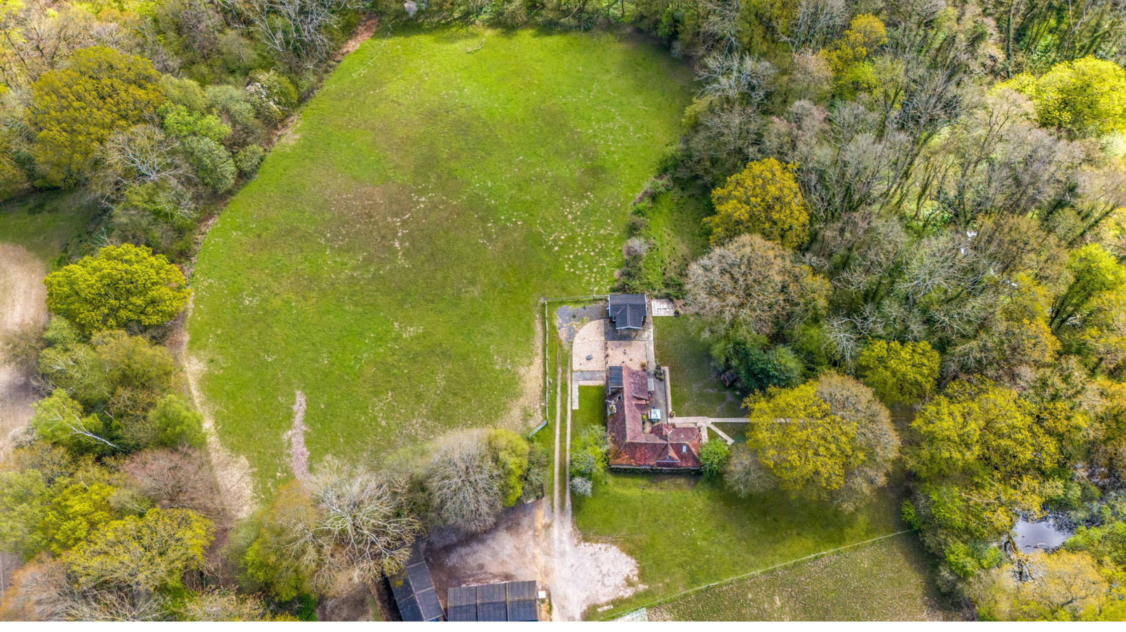
Parrock Lane, Upper Hartfield, Hartfield, East Sussex, TN7 4AS