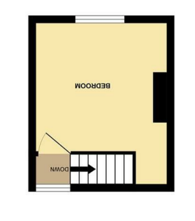
2ND FLOOR 134 sq.ft. (12.4 sq.m.) approx.