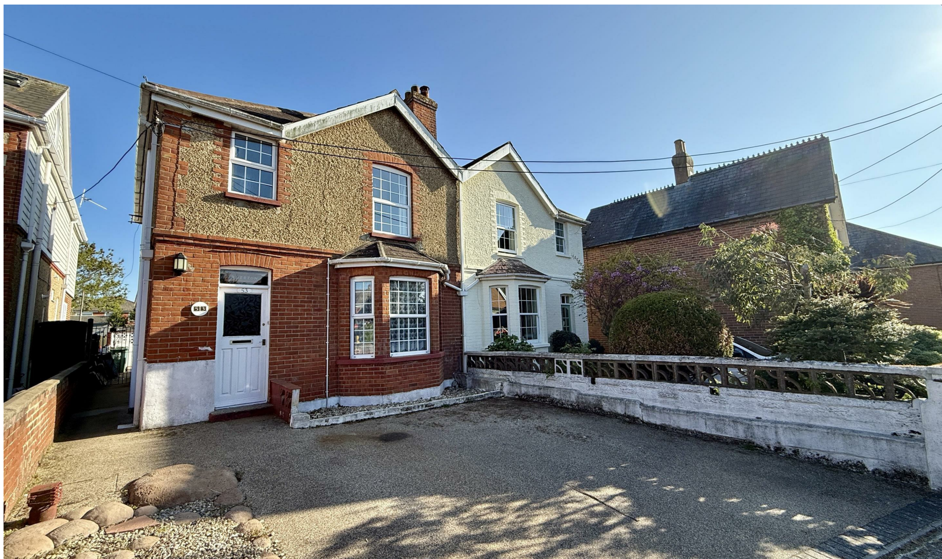
53 Church Road, Gurnard, Cowes £360,000