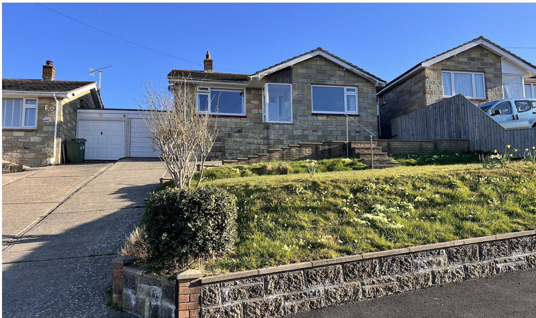
74 Stenbury View, Wroxall £315,000