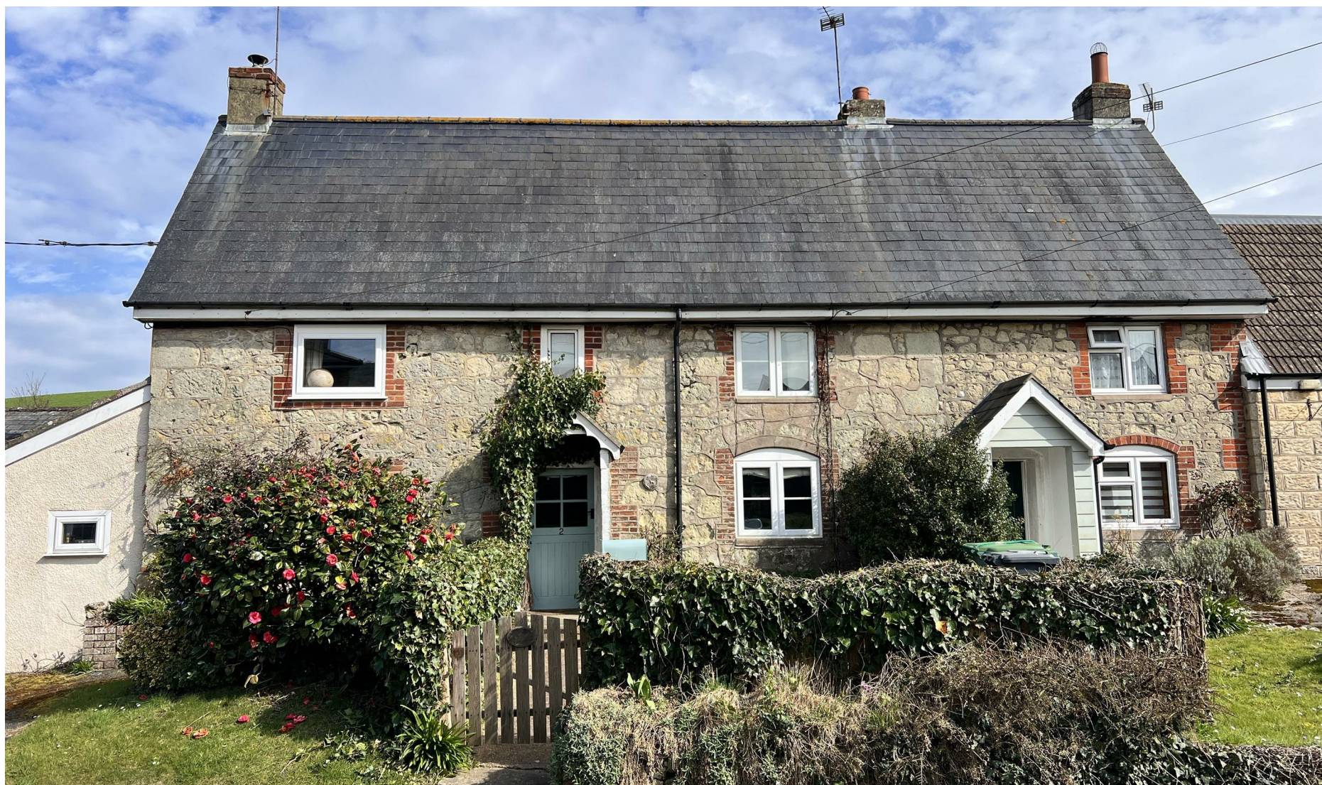
2 Springvale Cottages Main Road, Chillerton £265,000