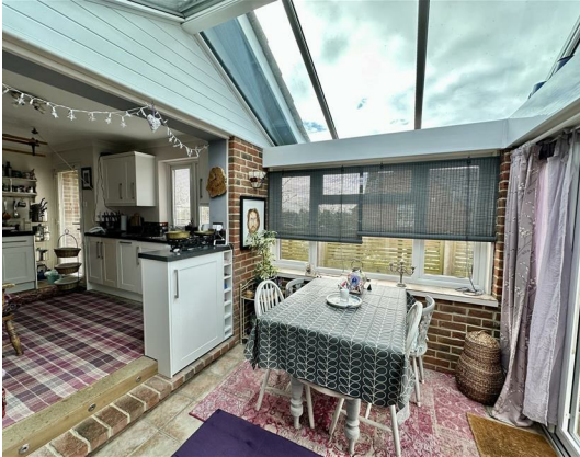
plate and induction hob, provides a centrepiece to the room and ambient heat, creating a cosy warmth through the cold months. UPVC double glazed side door and opening through to: