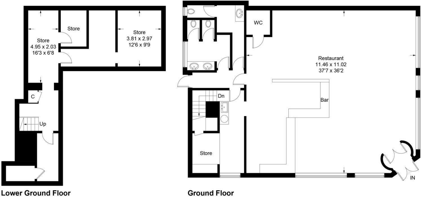
Illustration for identification purposes only, measurements are approximate, not to scale. Fourlabs.co © (ID1229779)

Approximate Gross Internal Area = 219.5 sq m / 2363 sq ft