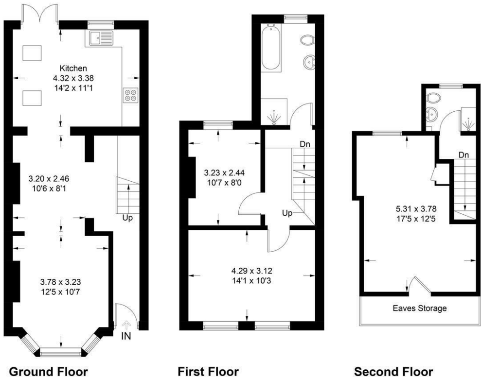
Illustration for identification purposes only, measurements are approximate, not to scale. floorplansUsketch.com © (ID1120415)

Approximate Gross Internal Area = 102.9 sq m / 1108 sq ft (Excluding Eaves Storage)