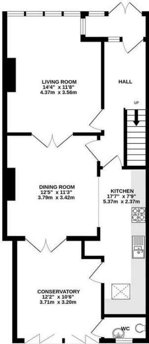
GROUND FLOOR 643 sq.ft. (59.8 sq.m.) approx.