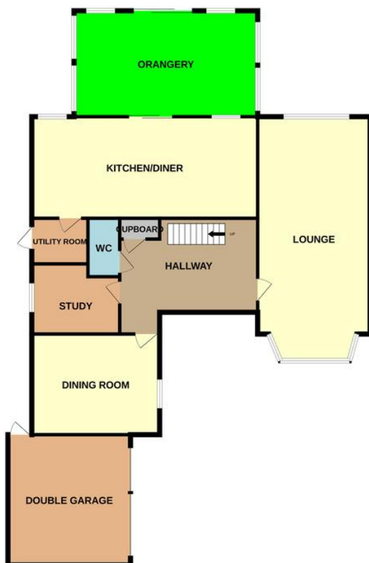
GROUND FLOOR 1596 sq.ft. (148.3 sq.m.) approx.