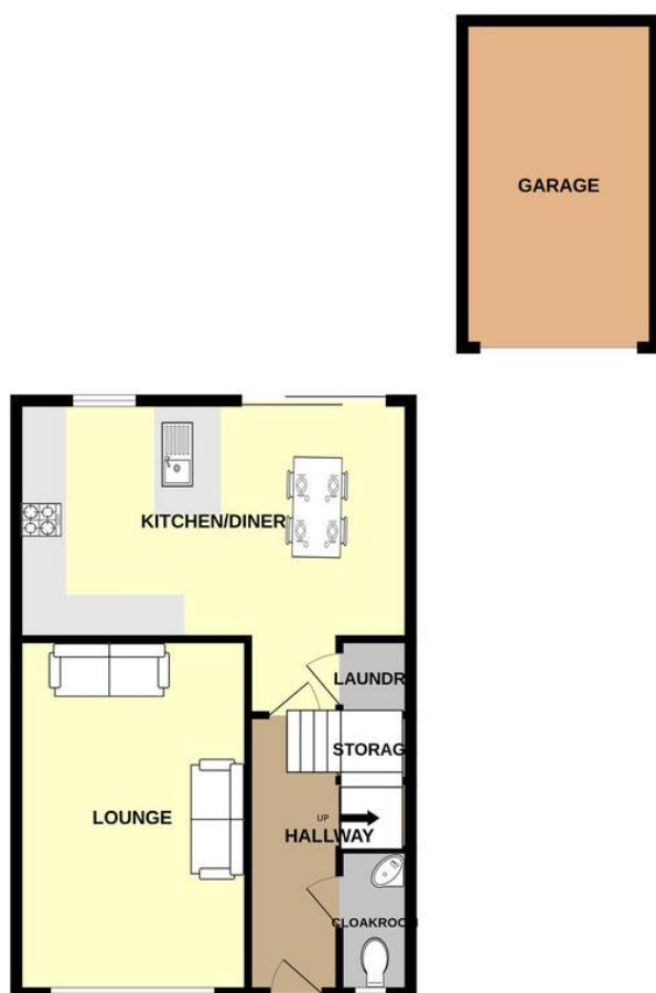
GROUND FLOOR 708 sq.ft. (65.7 sq.m.) approx.