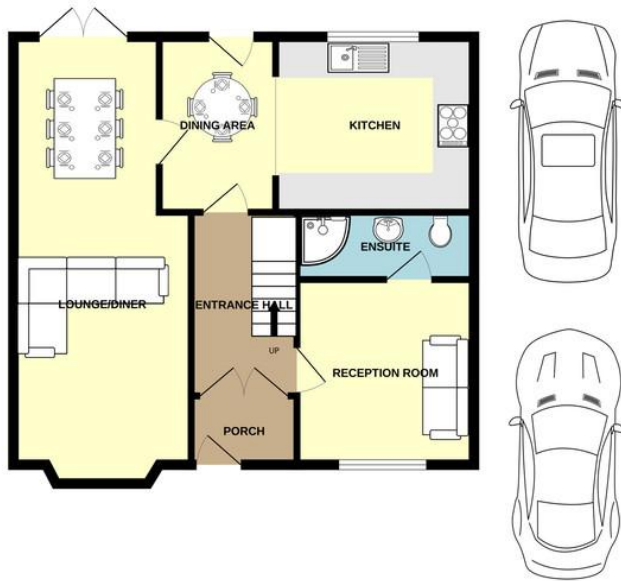
GROUND FLOOR 630 sq.ft. (58.6 sq.m.) approx.