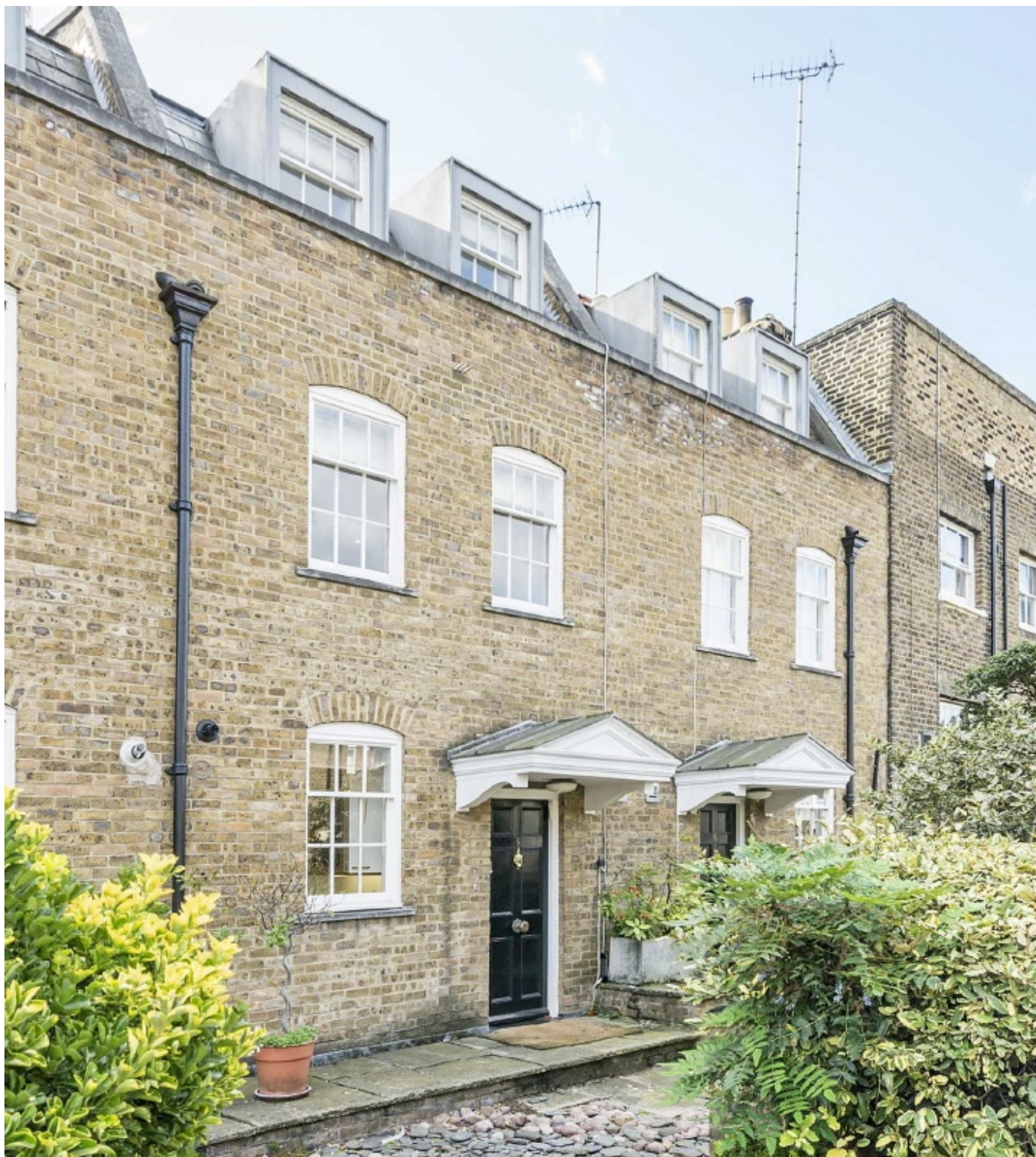
Greens Court, W11 £1,850,000