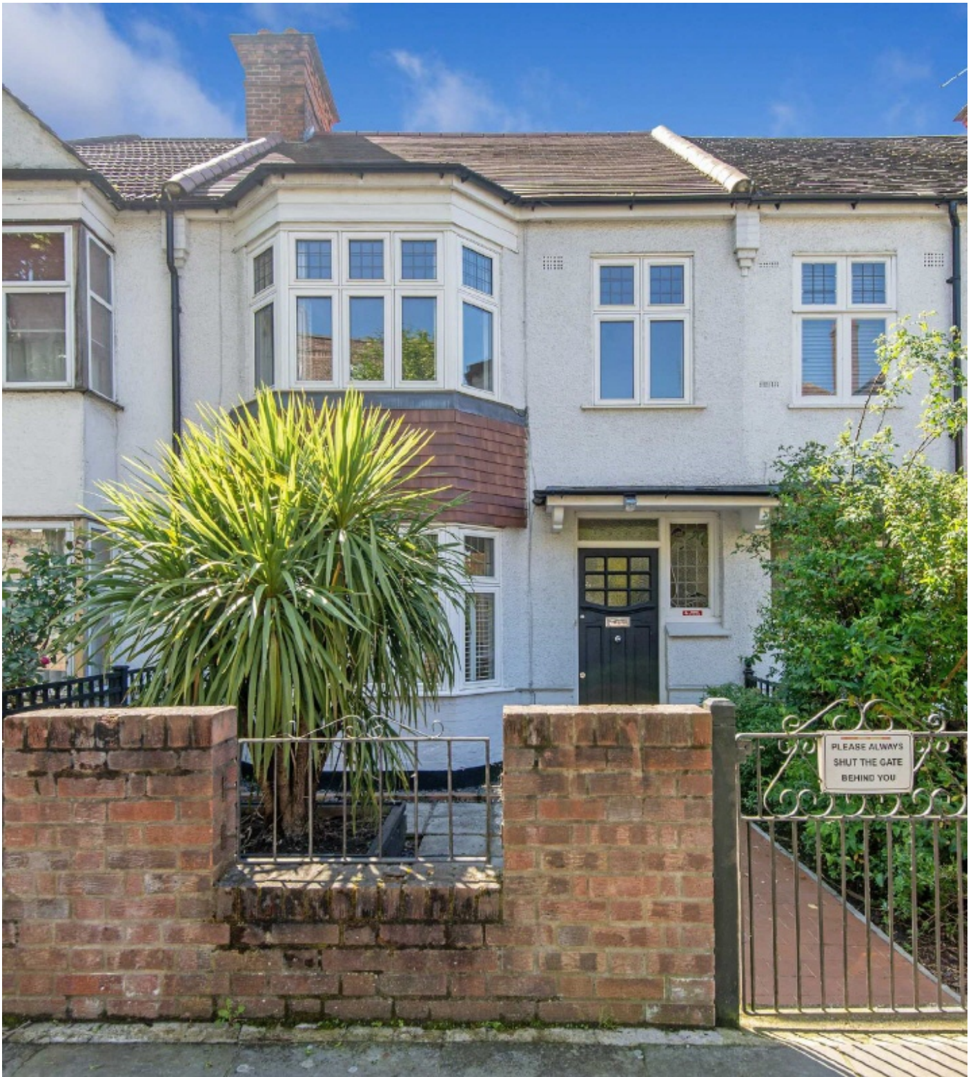
Dalgarno Gardens, W10 £1,150,000