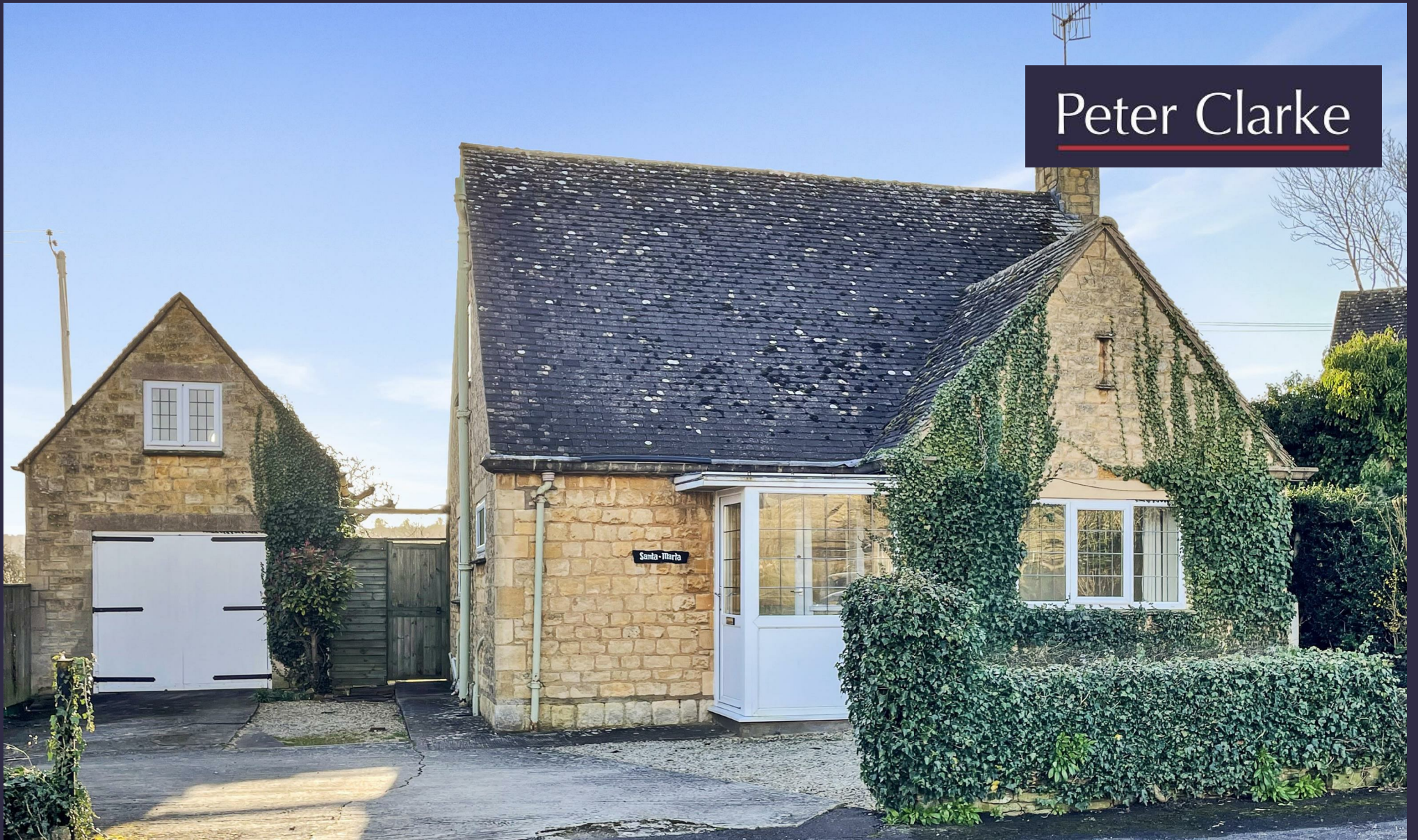
Santa Marta Littleworth, Chipping Campden, GL55 6BB