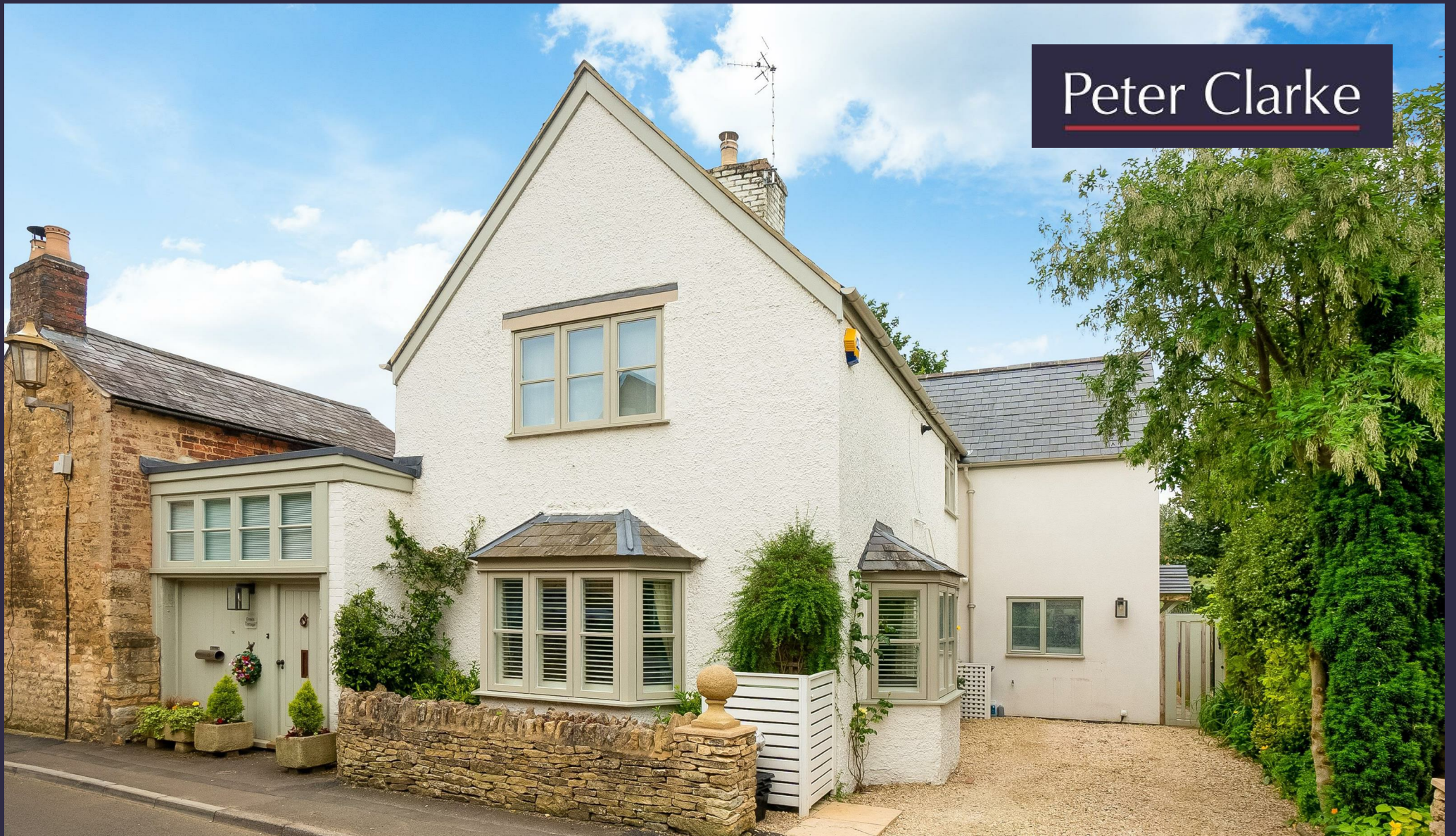
Green Cottage, Park Road, Chipping Campden, GL55 6EB