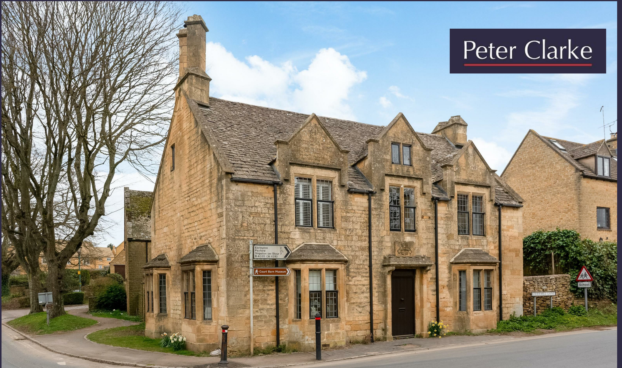
1 Weighbridge Court, Chipping Campden, Gloucestershire, GL55 6JH