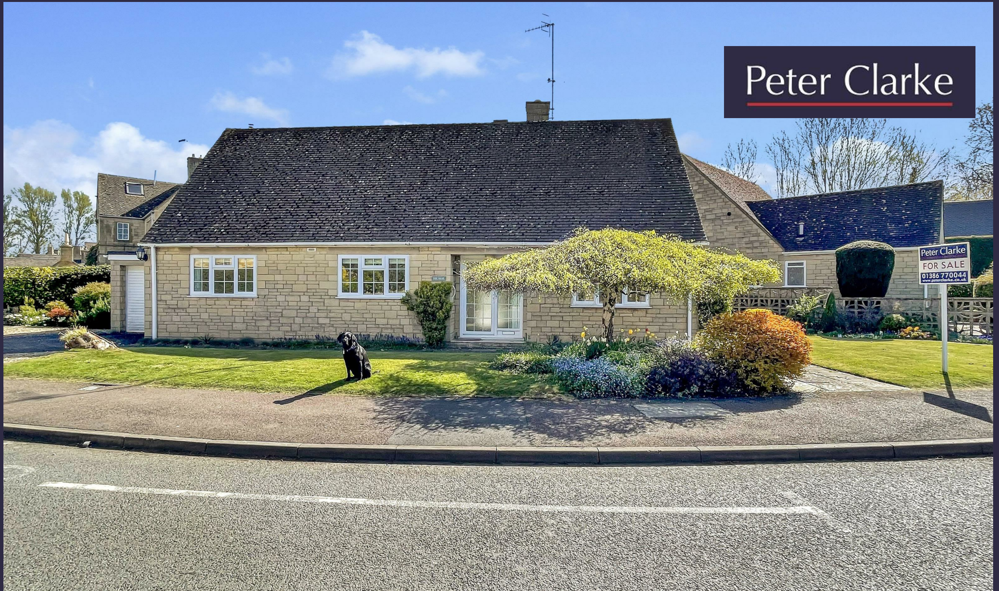
The Nene, George Lane, Chipping Campden, GL55 6DA