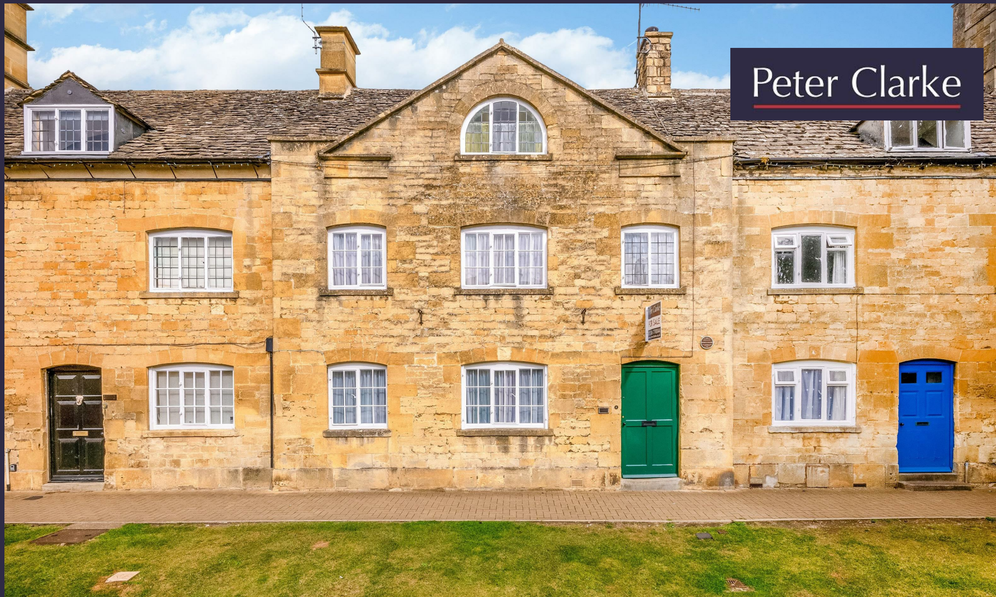
Davies House Lower High Street, Chipping Campden, GL55 6DZ