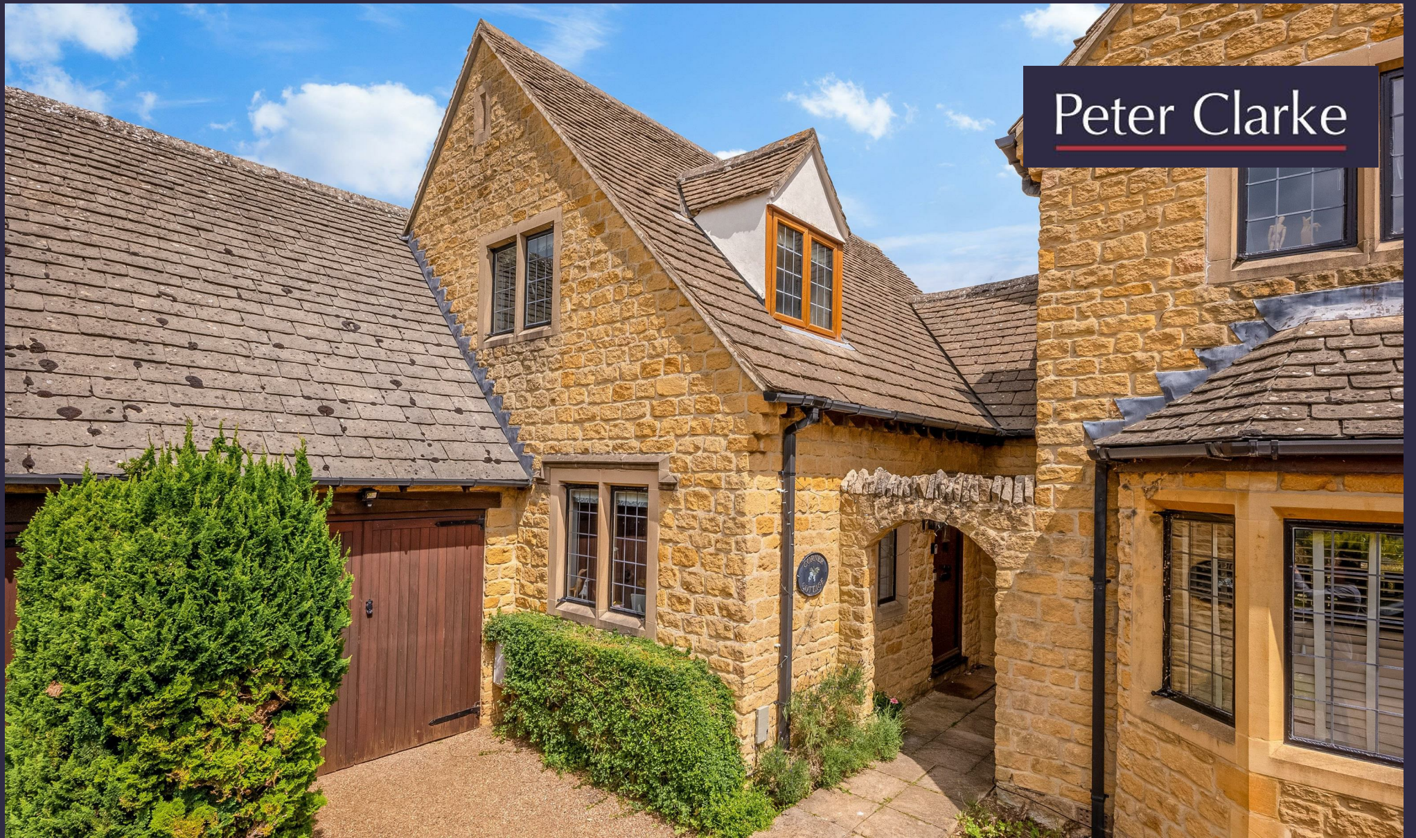
2 Inverlea Court, Mickleton, GL55 6TZ