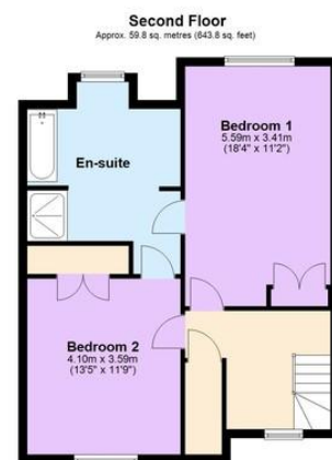
Second Floor Approx. 59.8 sq. metres (643.8 sq. feet)

Total area: approx. 307.9 sq. metres (3314.3 sq. feet)