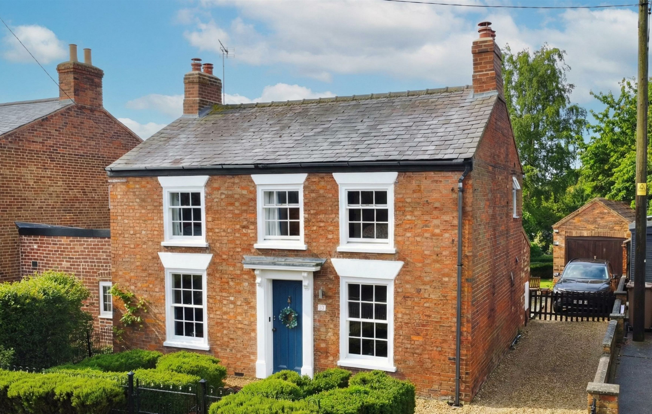
Hill Cottage, 16 Fosse Lane Thorpe-On-The-Hill