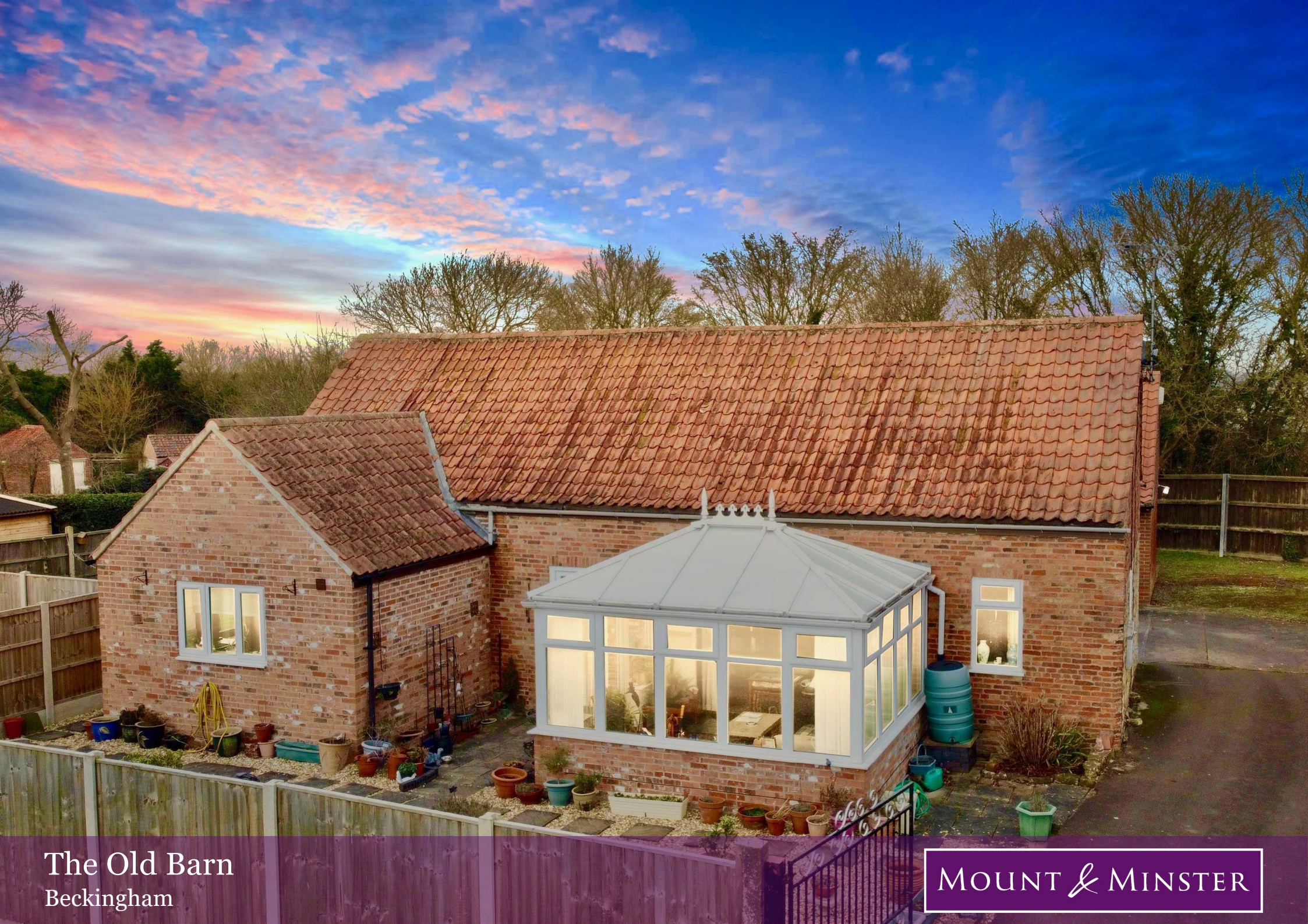
The Old Barn Beckingham