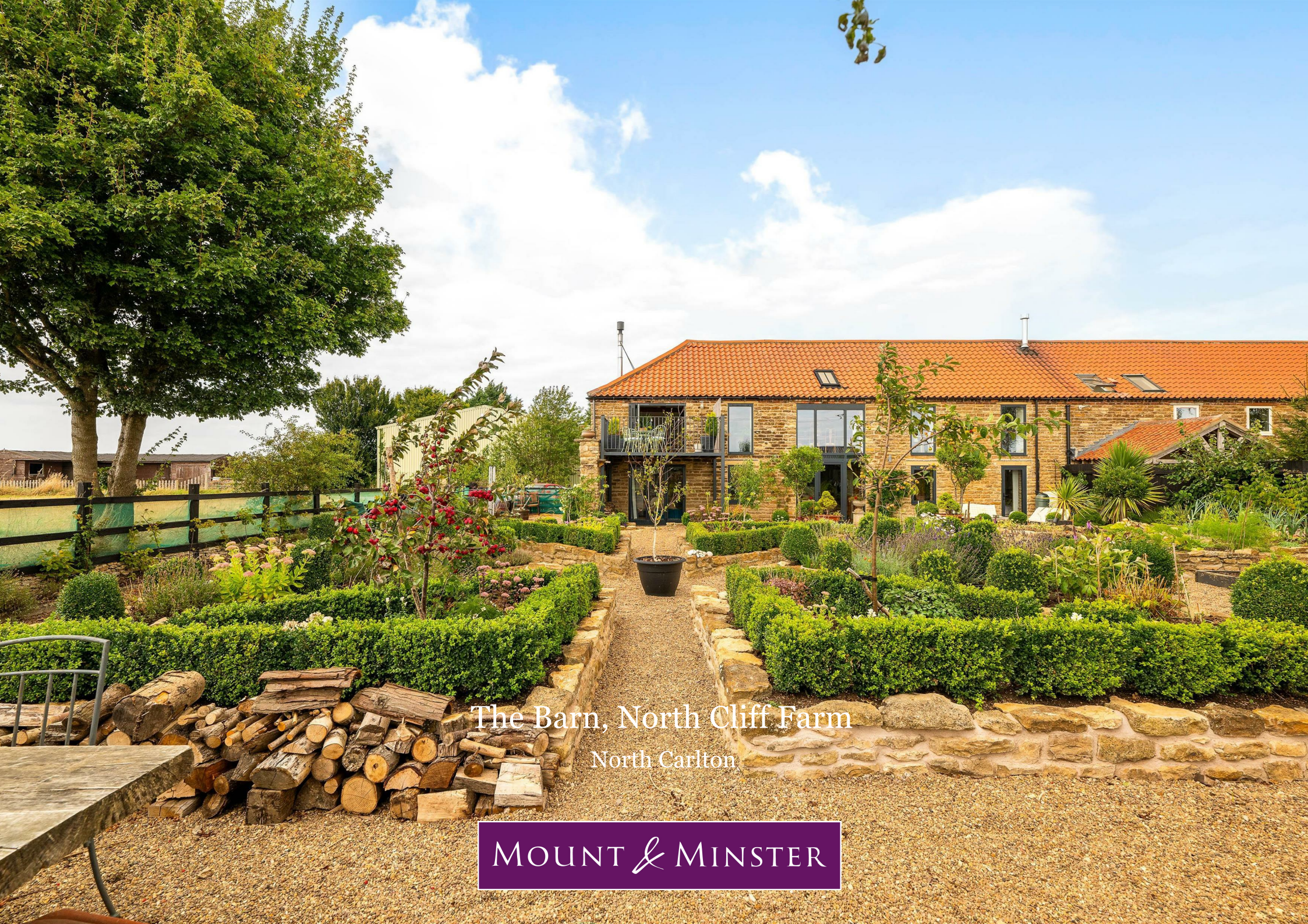
The Barn, North Cliff Farm North Carlton