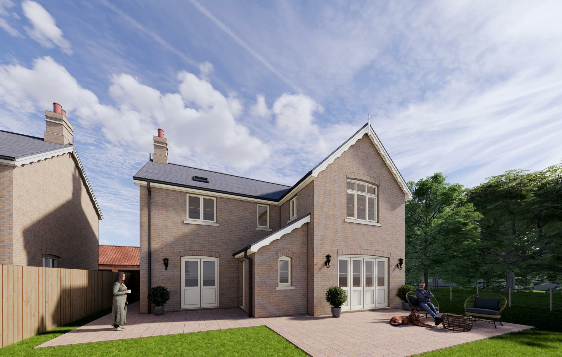
Maple House Hackthorn