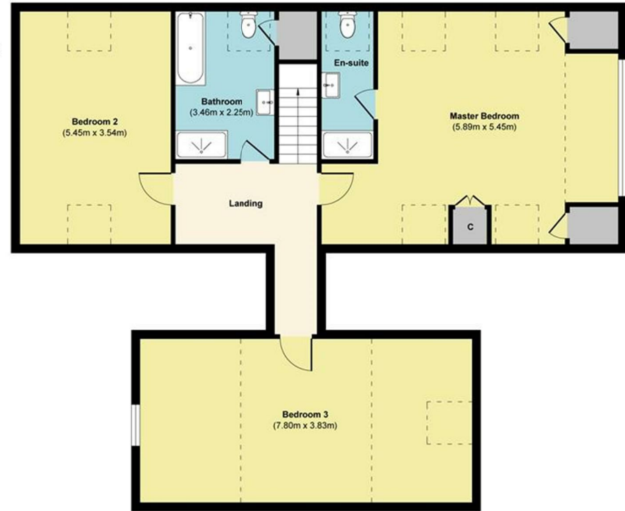
First Floor Approximate Floor Area (108.59 sq. m)

Approx. Gross Internal Floor Area 209.39 sq. m (Excluding Carport)