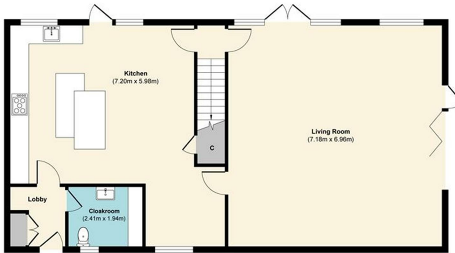
Ground Floor Approximate Floor Area (100.80 sq. m)