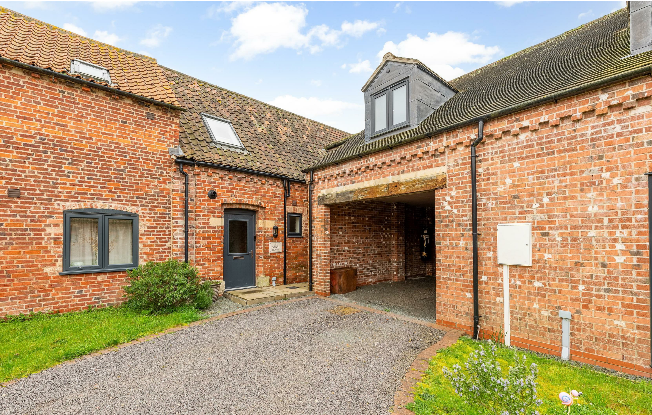
The Coach House, South Farm, Thurlby