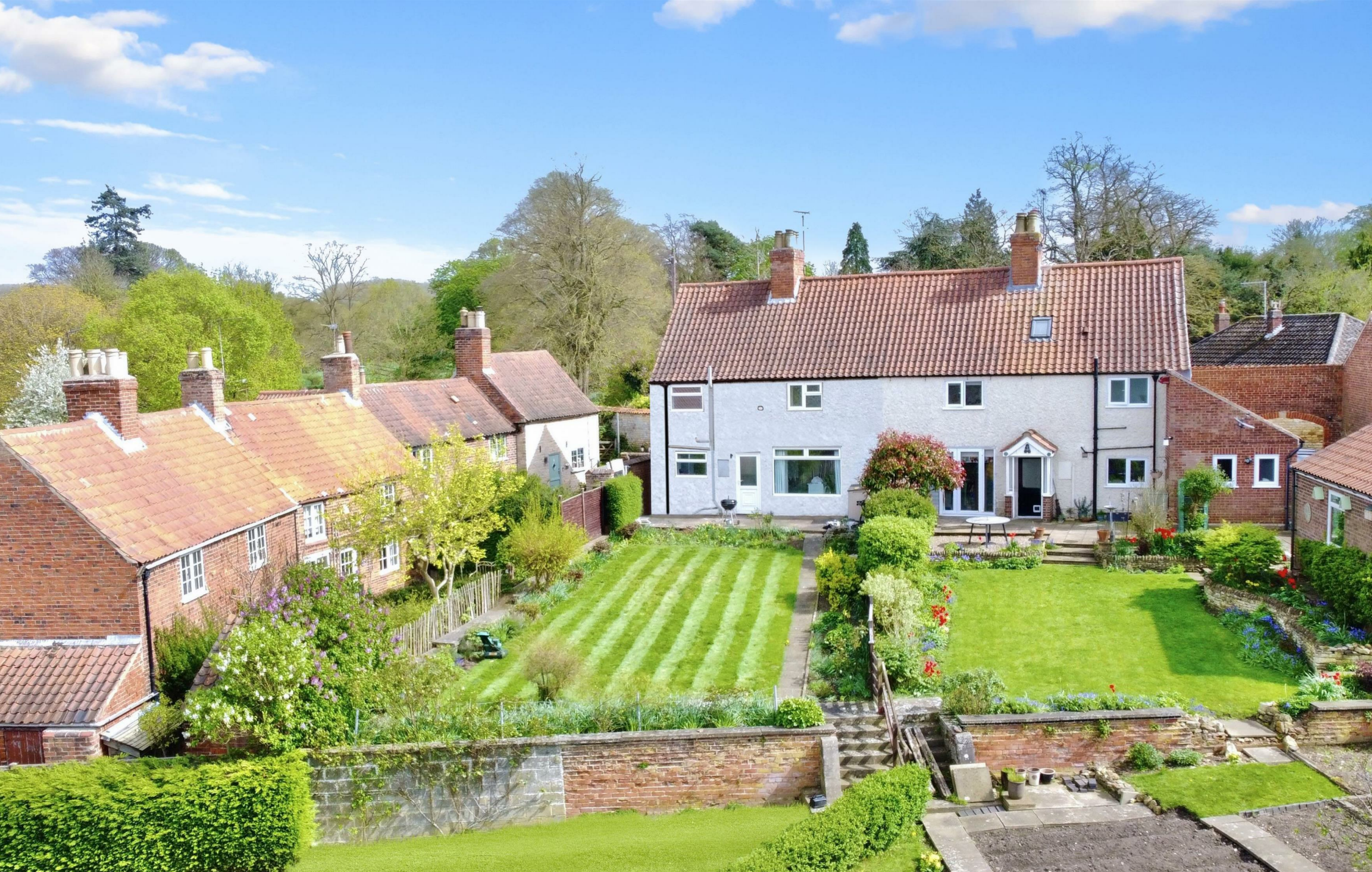
Brookes Cottage Fulbeck