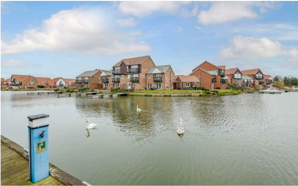
25 Marine Point Apartments, Marine Approach Burton Waters, Lincoln Approximate Gross Internal Area 68 Sq M/731 Sq Ft