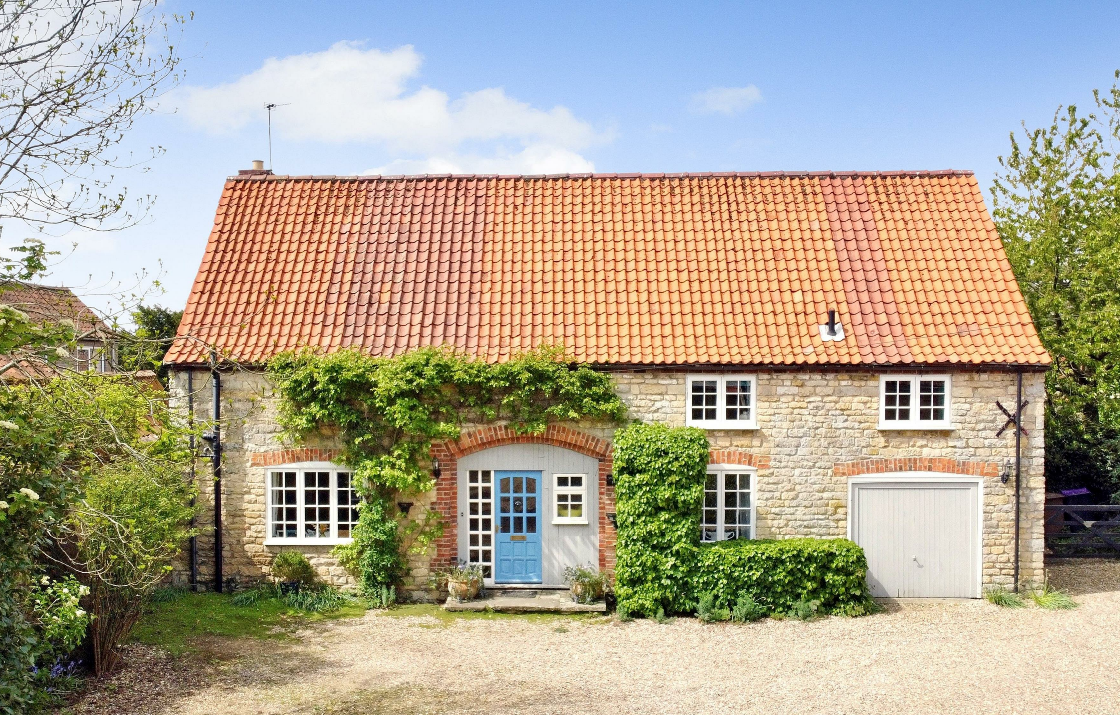
Sycamore Barn Wellingore