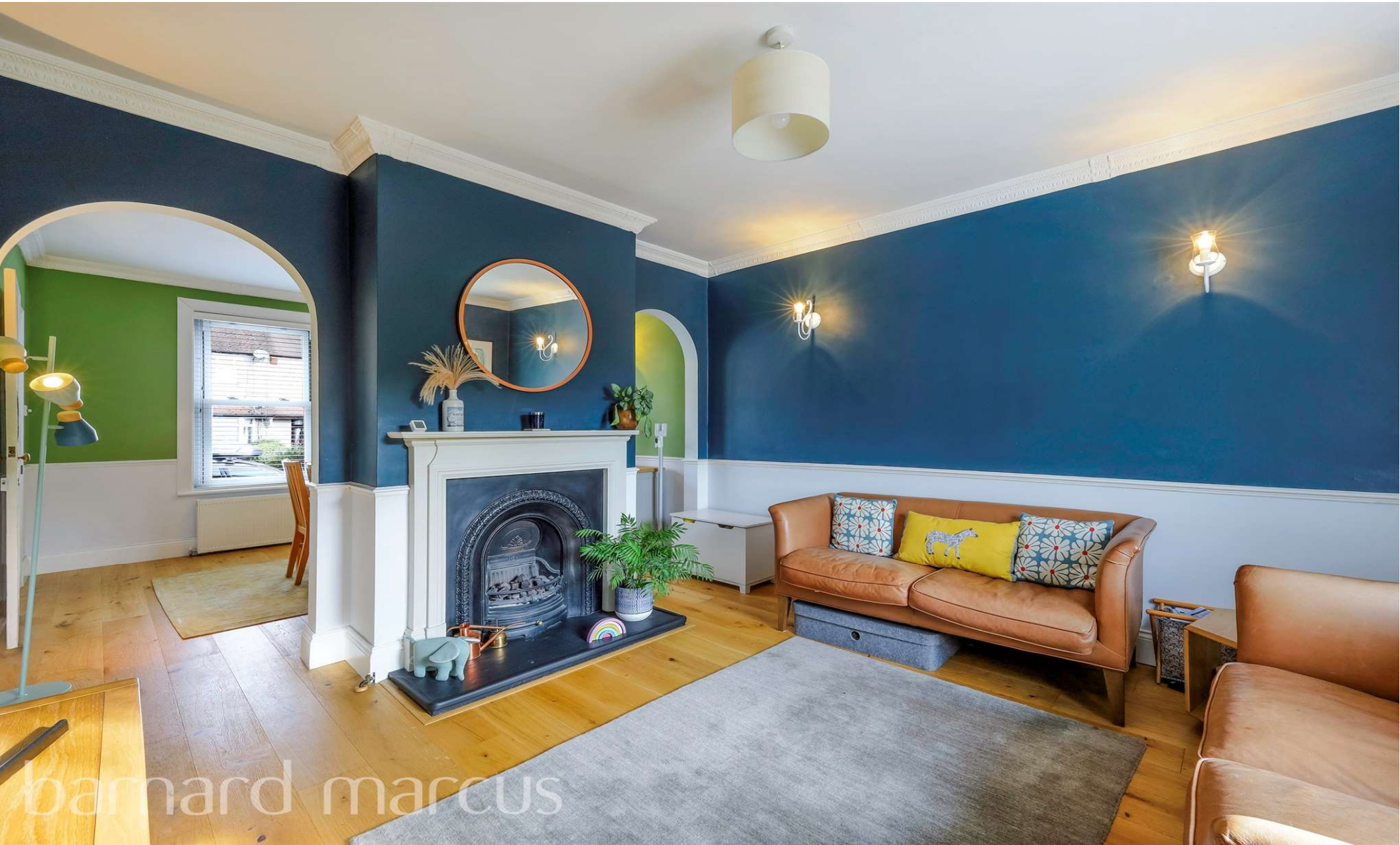
Bourne Road, Merstham Redhill RH1 3HF