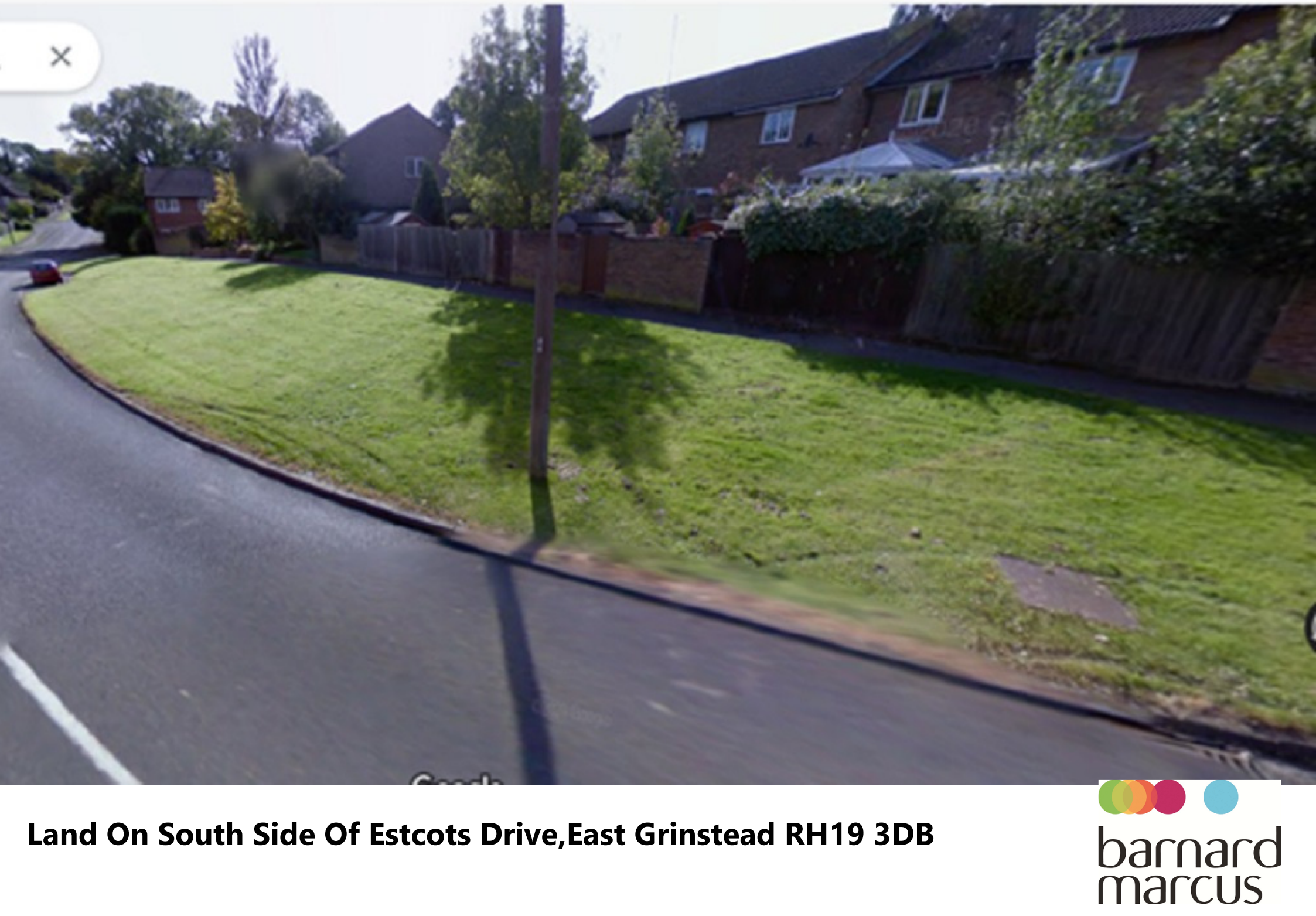
Land On South Side Of Estcots Drive, East Grinstead RH19 3DB