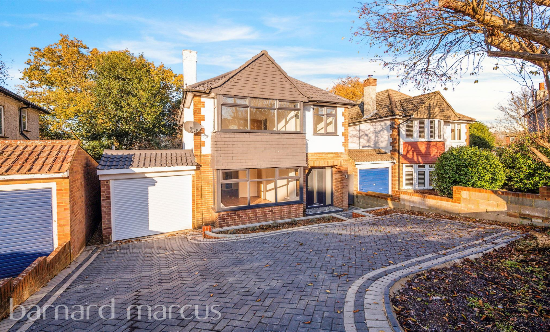
Oakwood Close, Redhill RH1 4BD