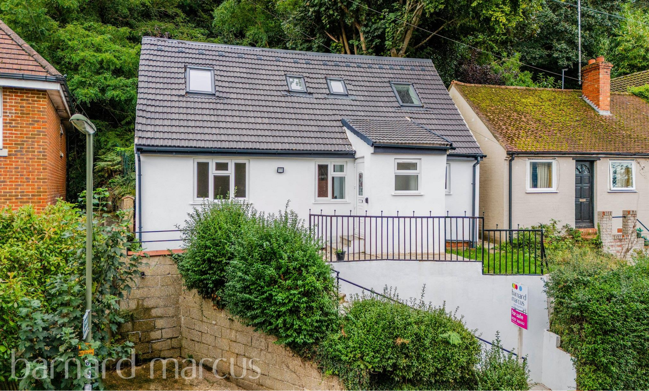
Garlands Road, Redhill RH1 6NT