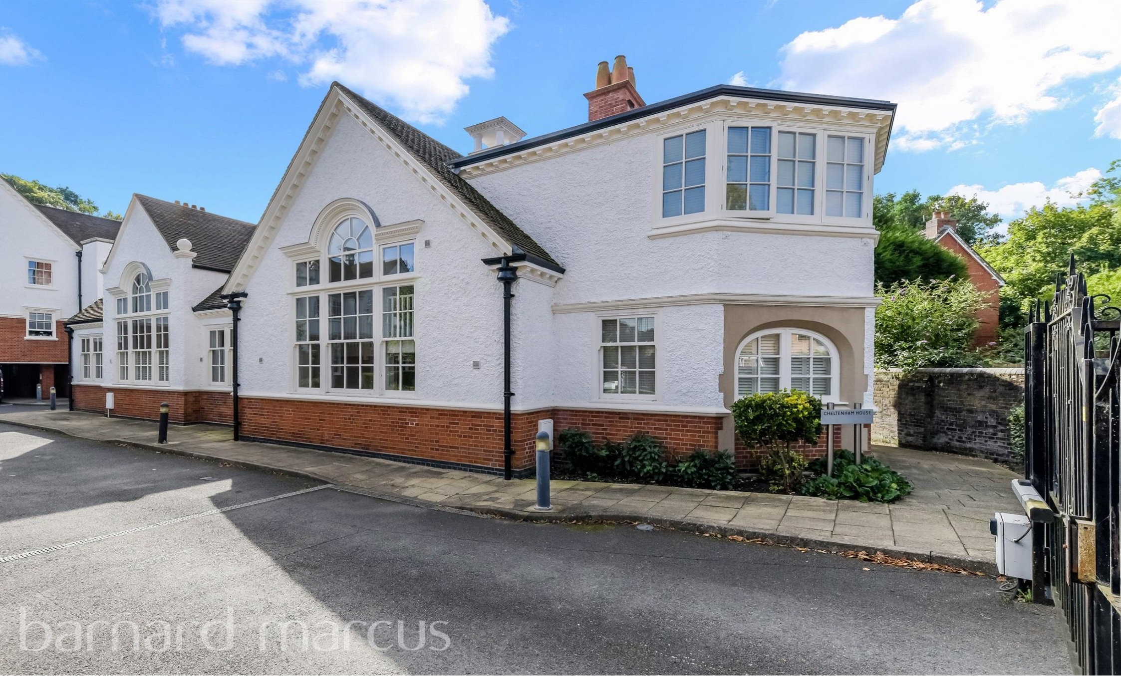
Cheltenham House Old School Close, Redhill RH1 2FP

Not for marketing purposes INTERNAL USE ONLY