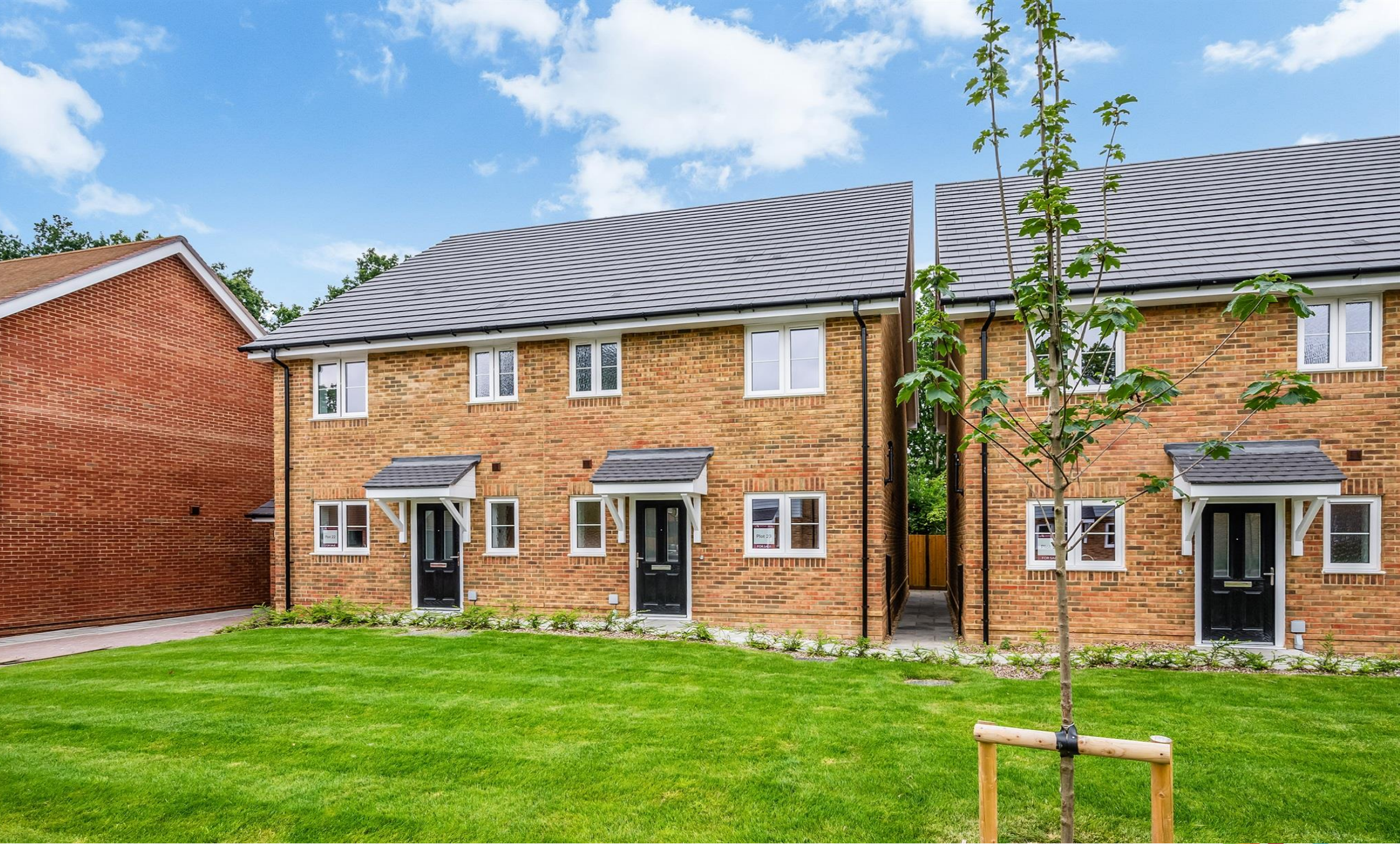
Evelyn Gardens, Felbridge East Grinstead RH19 2NT