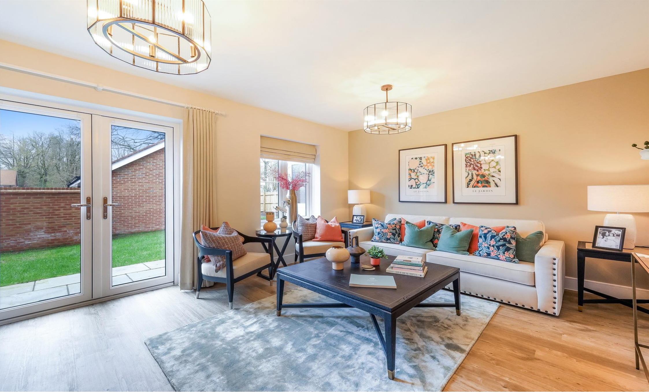
Evelyn Gardens, Felbridge East Grinstead RH19 2NT