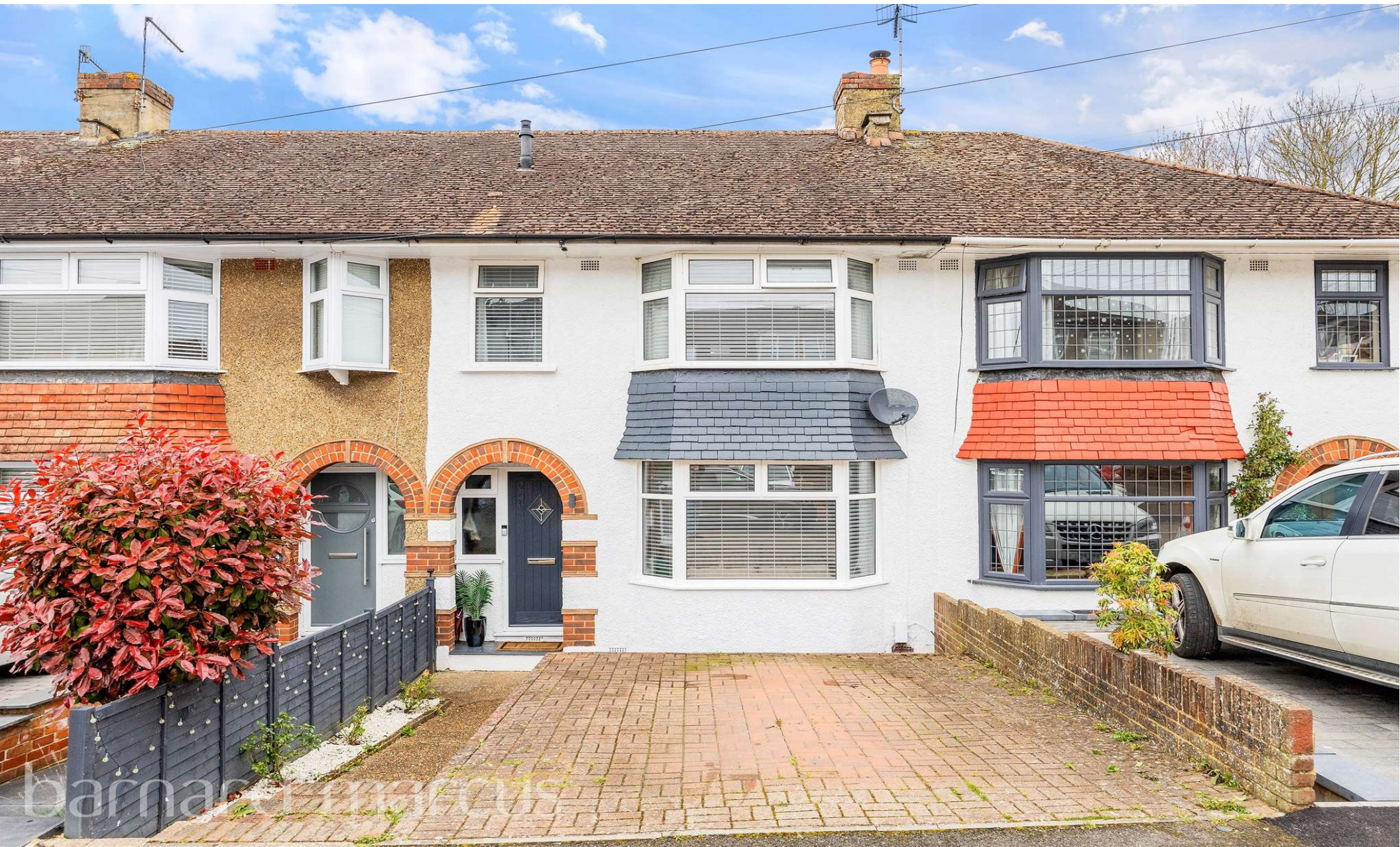
Prince Albert Square, Redhill RH1 5AP