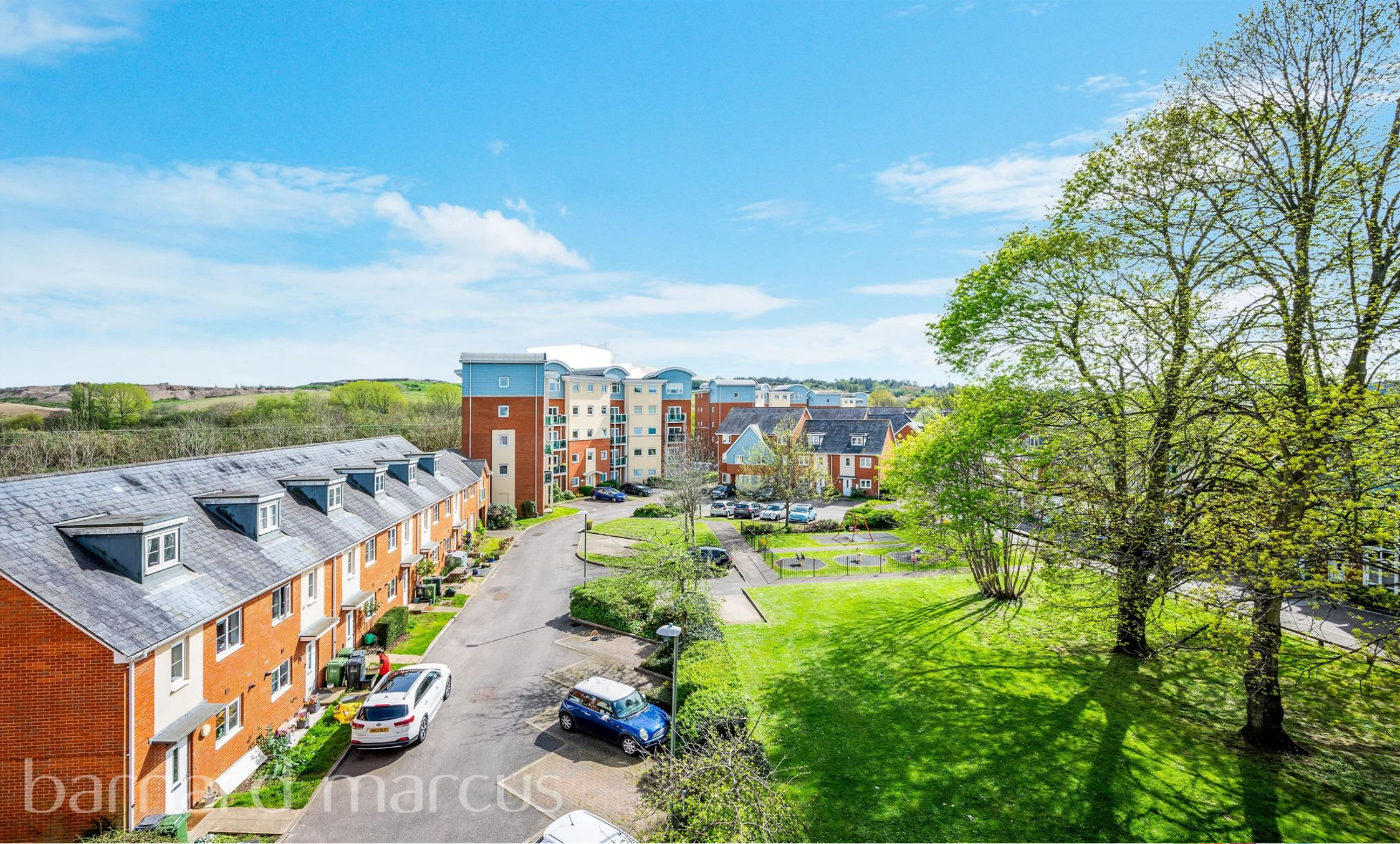
Buckland Court Rubeck Close, Redhill RH1 1TH